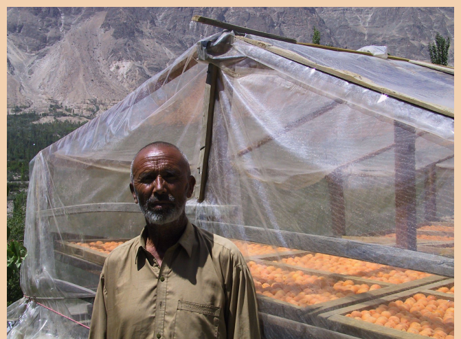
Farmer drying apricots in 2010