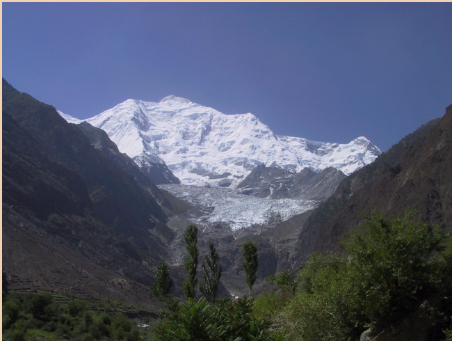
Rapakoshi Mountain high above the fertile valleys of Gilgit Baltistan