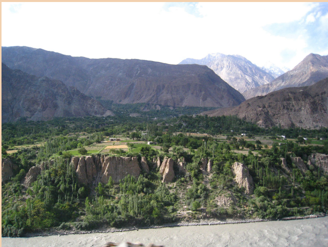
A village in the valley, bounded by mountains and the Hunza river