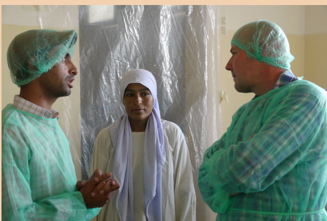
Discussions with factory staff in 2014