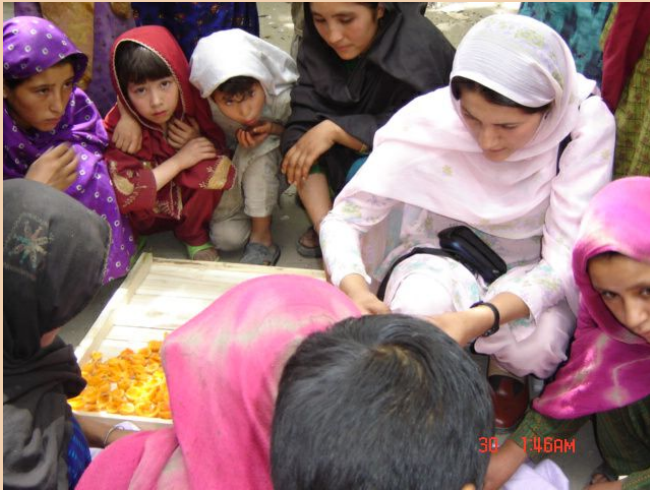
Women staff of Mountain Fruits training village women in hygienic processing of fruits