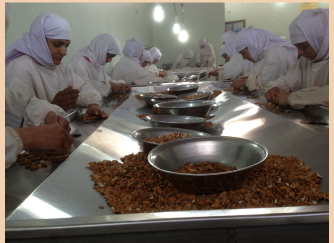
Mountain Fruits, walnuts sorting