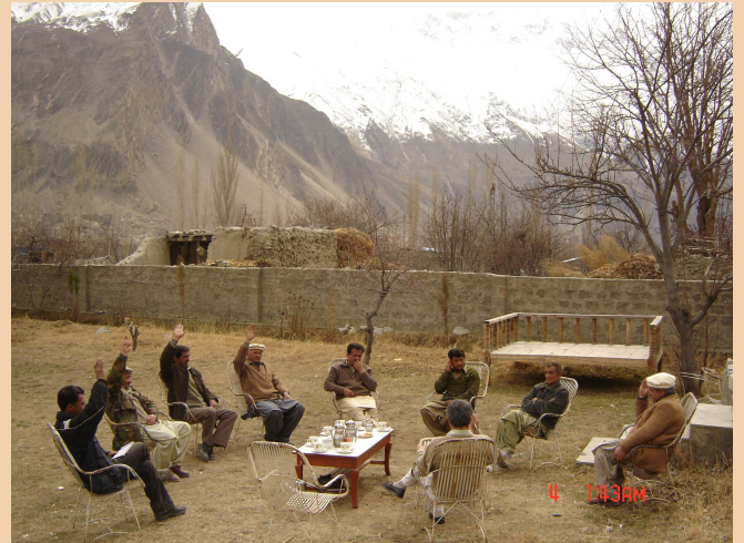
PEB Mountain Fruits Farmers Association meeting with discussions and voting