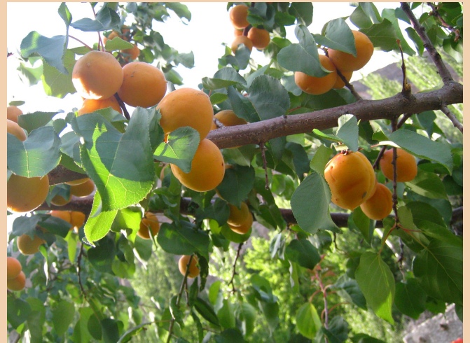
Aprioc Trees close to harvest-time in August