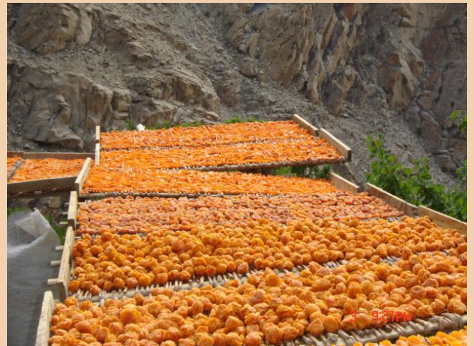
Trays of apricots drying on a roof-top