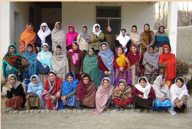
Mountain Fruits lady workers